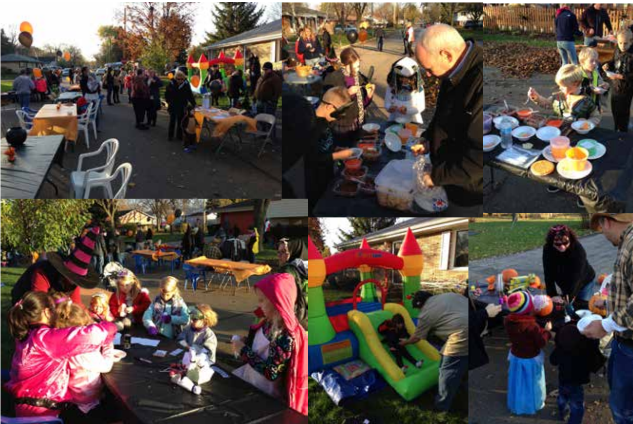
Scenes from the neighborhood: A beautiful fall day provided a great backdrop to fun, food and activities at the THNA Halloween extravaganza!

This is an introductory offer for adults and children.